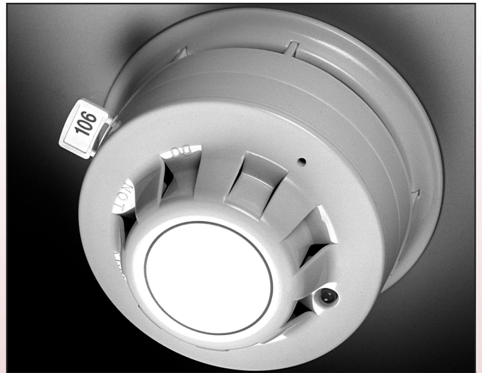
Part no 45681-276 with XP95 optical detector fitted

The Ancillary Base Sounder is loop-powered and requires no external power supply. It operates at 17–28V DC.