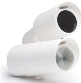
Additional Detector Pack